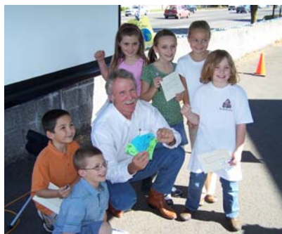
Former Governor John Kitzhaber and Forest Ridge students