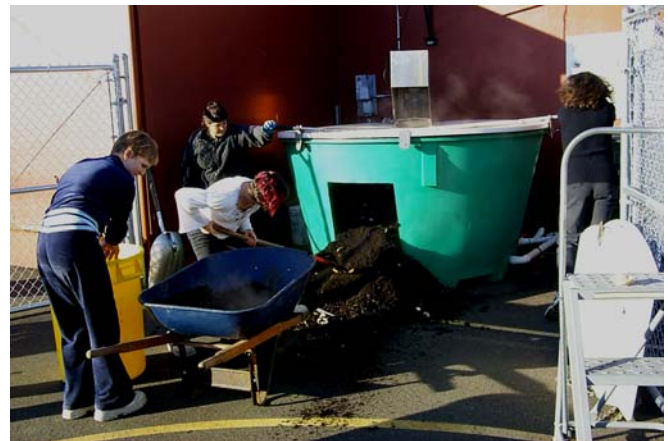
River Road El Camino Elementary Earth Tub

Cesar Chavez Elementary School composts all its food waste, soiled napkins, and food boats in an in-vessel electric Earth Tub composter. The Earth Tub composter can take up to 10% meat, so leftover hamburgers, chicken nuggets, hot dogs and pizza, as well as salad bar offerings, are mixed with sawdust and quickly turn into dark crumbly compost for the new school garden. The school garden parent group oversees the daily turning of the compost, and twice a year they empty the compost, screen it, and apply it to the school garden. The school is composting over 500 pounds per month in their Earth Tub.