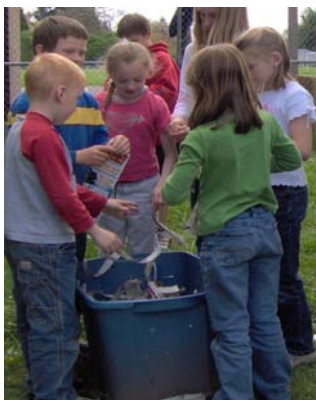
Corridor Elementary students shredding newspaper for their worm bins.

In a nutshell, if your school only wants to compost fruits and vegetables, and you've got less than 400 pounds each month to compost, consider using a couple backyard compost bins to get your program started, and add worm bins for fun and variety.