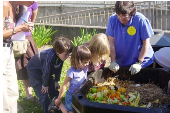
Adams Elementary School students checking temperatures in the worm bins.