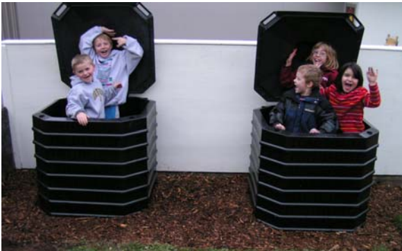
Adams Elementary students check out their bins

Students at Eugene schools “SCORE” big with their composting efforts as they Sort, Compost, Organic, Rot, and Educate students about the importance of composting cafeteria food waste. Using worm bins, backyard compost bins, and commercial sized in-vessel Earth Tubs, Eugene Green Schools are leading the way when it comes to composting cafeteria food waste.